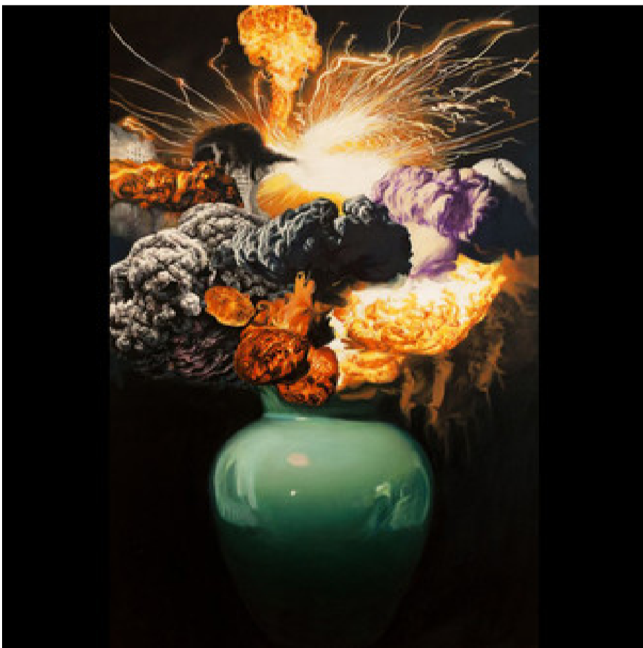
Keith Tyson 22 May — 7 Sep 2019