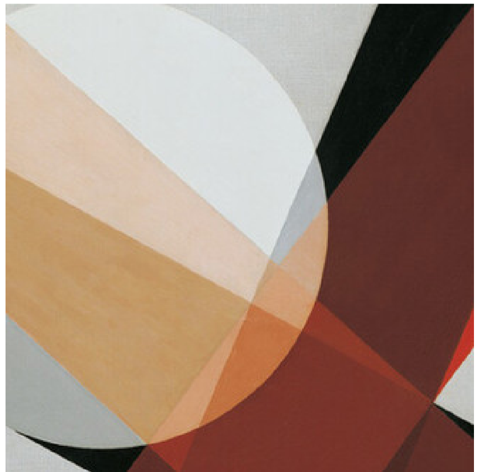
László Moholy-Nagy 22 May — 7 Sep 2019